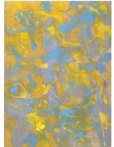
James Brooks. V-1952 . 1952.