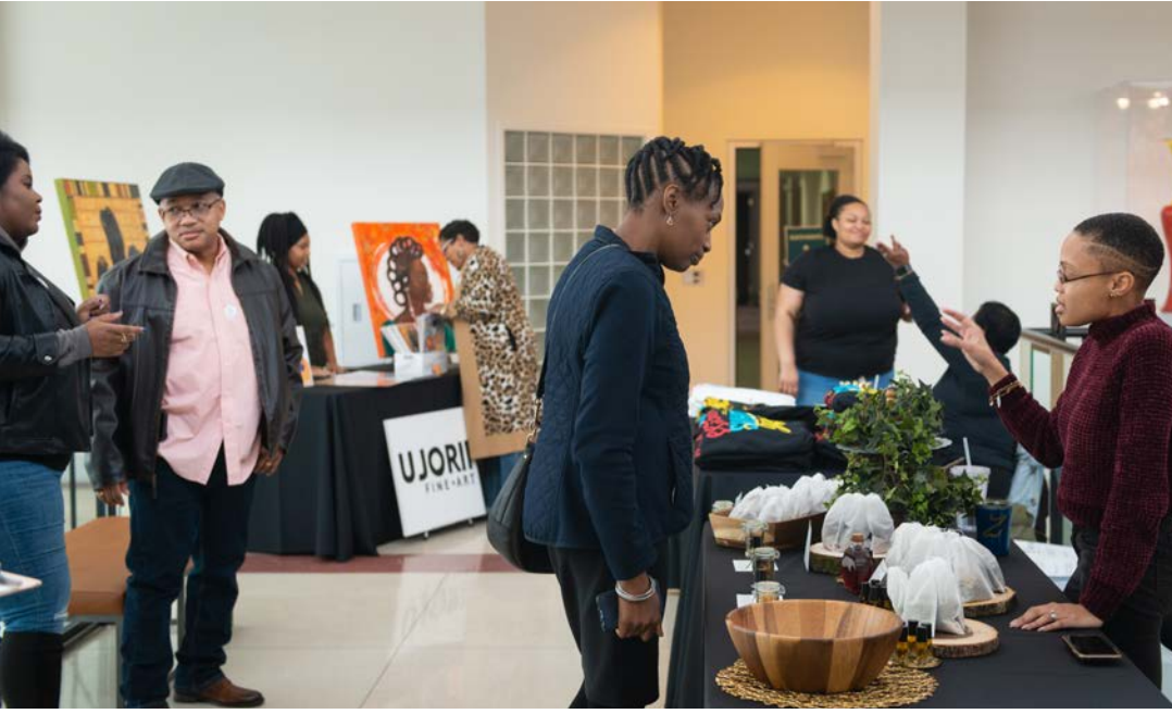
All: MLK Celebration attendees browse the Think Black, Buy Black pop-up shop