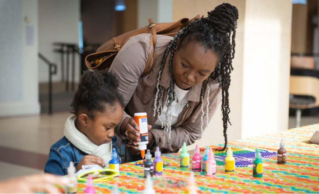
Top: MLK Celebration attendees pose in the complimentary portrait booth. Left: The NiA Company mesmerizes the crowd with live storytelling and singing. Right: MLK Celebration attendees complete one of the art activities.