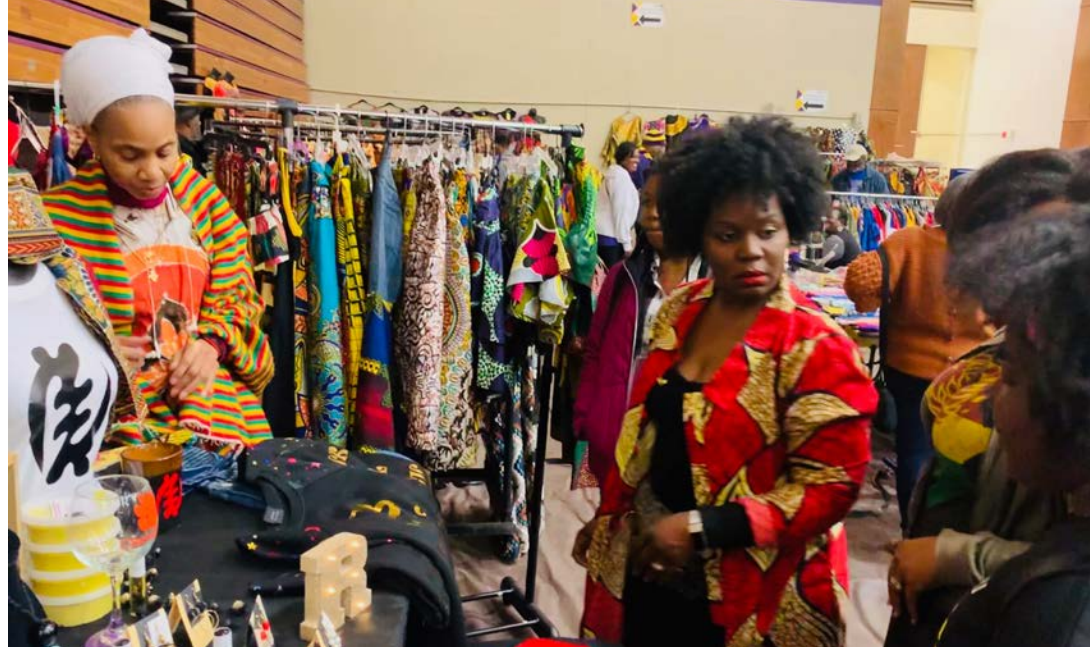
All: Action shots from Benedict College's Harambee Festival. FAAAC tabled at the community village.